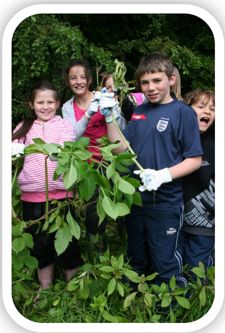
Balsam bashing activity